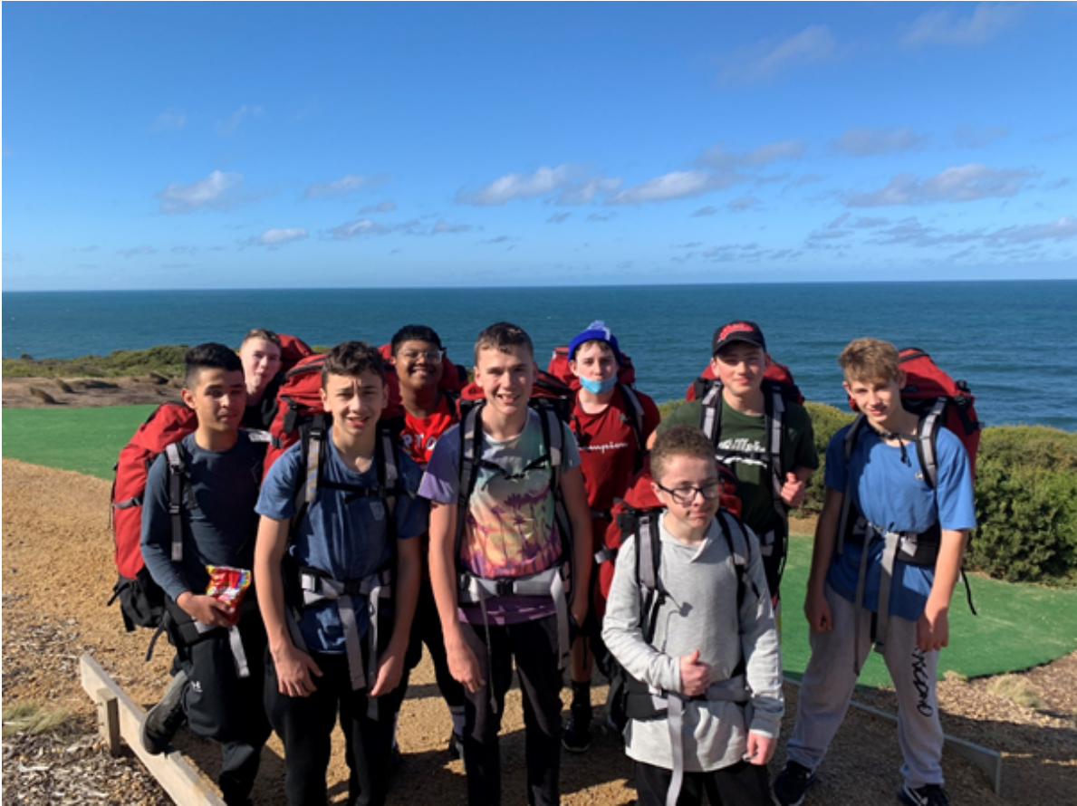
Year 8 Camp - Anglesea