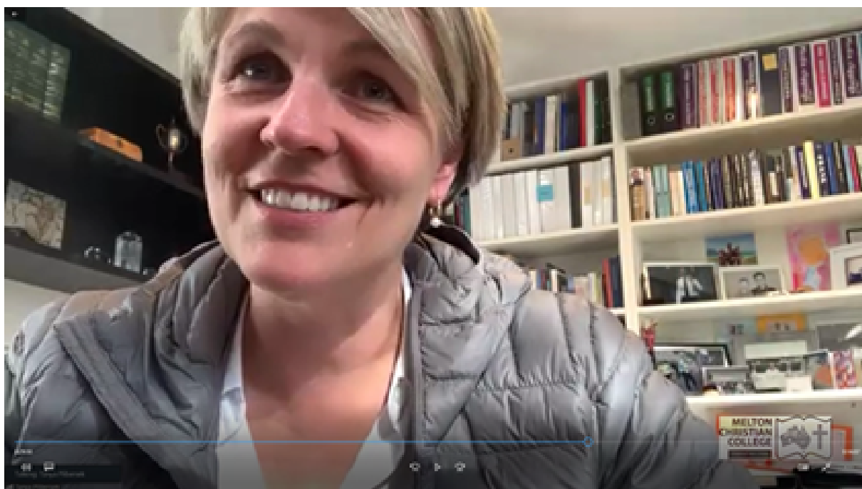
Legal Studies Interview with Hon. Tanya Plibersek MHR